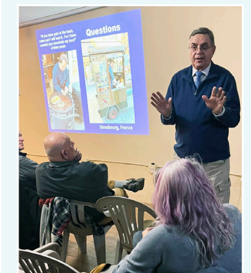
The ETB Tree Talks Series featured four monthly lectures at the Kump House.