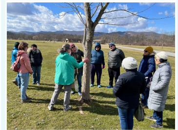
Winter Tree ID / Birding Walk at Glendale