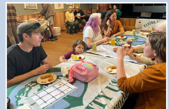
Former tree board members, volunteers, Division of Forestry urban foresters and others attended the celebration.