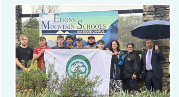
Arbor Day 2025 commemorations at Glendale Park and the Mountain School.