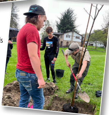
Above: Board members work at Tree Nursery at the Kump House. Right: Friends of Trees volunteer works on protecting trees at Glendale. Mountain School students participate in Arbor Day tree planting ceremony with WV DOF.

*Approximately 35 seedlings were planted as part of the Kump House Wetlands project.