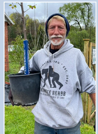
Elkins residents received free trees to plant in their front yards