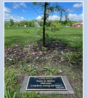
Memorial plaques were installed at Glendale Park for tree contributors.