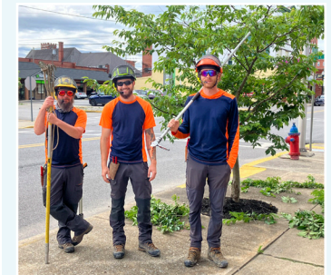
Downtown trees were pruned thanks to grant funding.