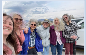
Tree board members finish handing out door hangers for Adopt-A-Tree.